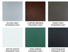
Standard color in Silvergray, Corten Brown, Dark Gray, Matte white, Pine Green, Matte black highly resistant to rust and decay